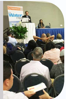
Table top by the breakout entrance, Logo on welcoming board & among exclusive sponsors, literature distribution. Recognition in website, event's program & guide.

Deliver your message as a thought-leader in your field and interact with qualified potential customers and professionals.