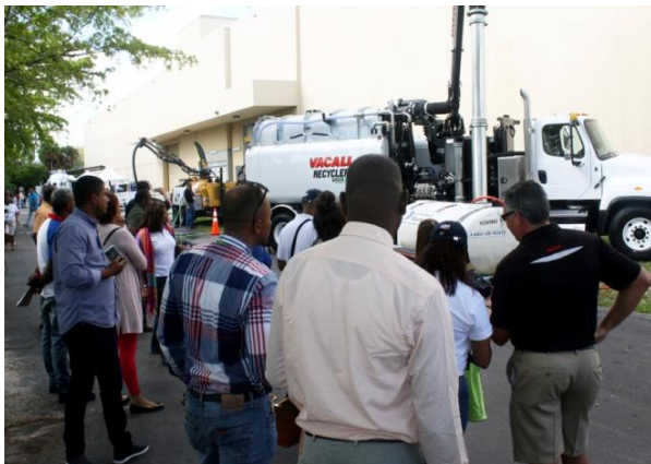
Demo at TWE17