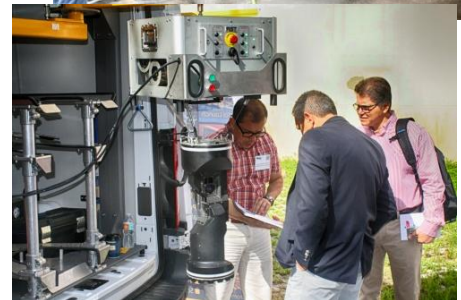
Demos at TWE17